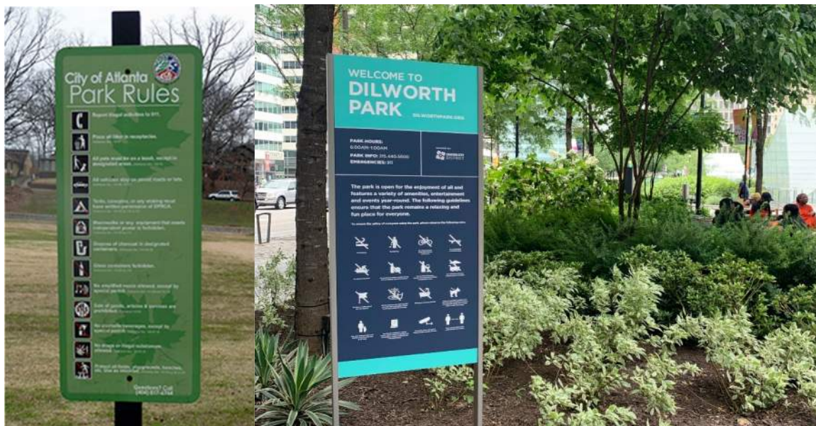
PARK RULES SIGNS