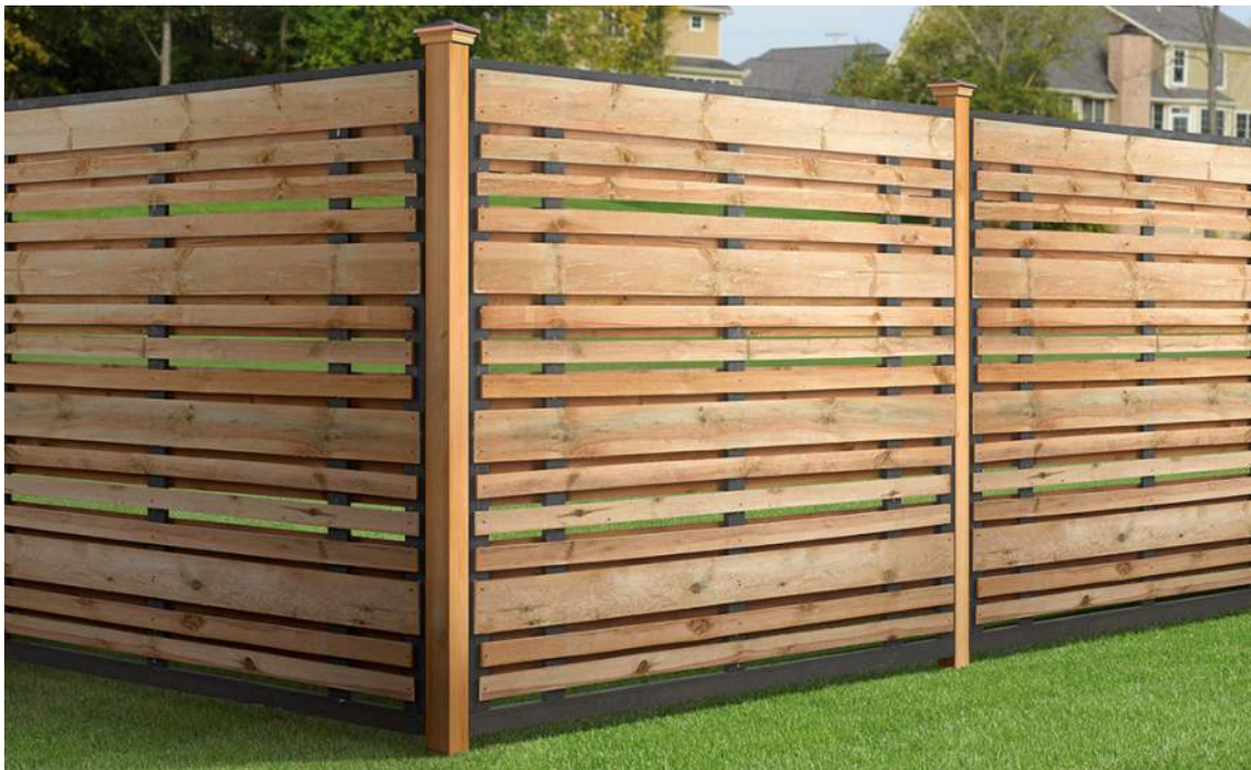
8' TALL RESTROOM AND 4' TALL TRASH RECEPTACLE SCREEN FENCE