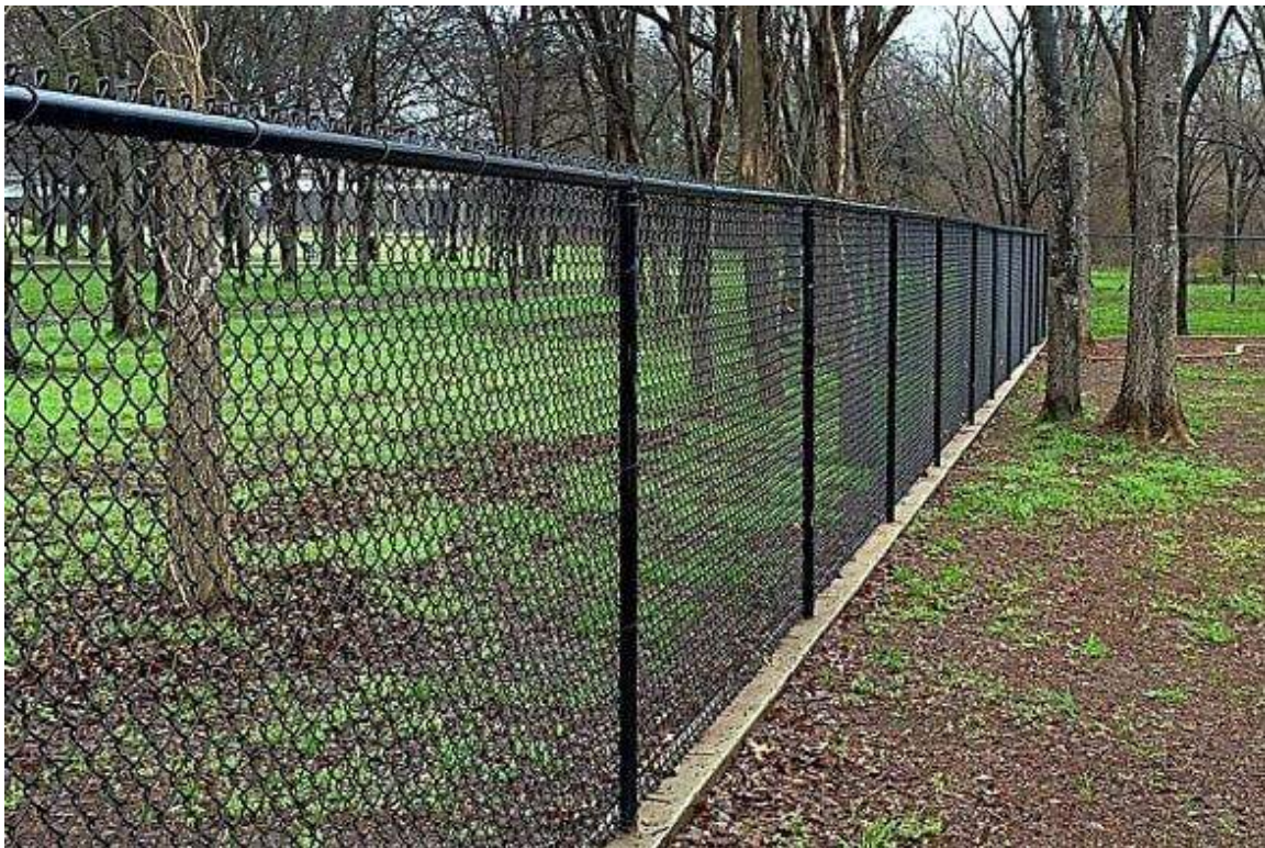
6' TALL BLACK VINYL-COATED CHAIN LINK FENCE FOR NORTH OF PARK