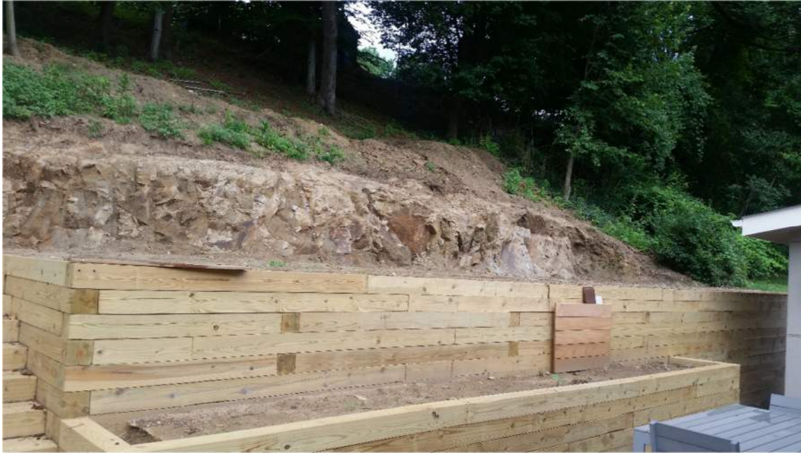
LOW TIMBER WALL (OVERLOOK)