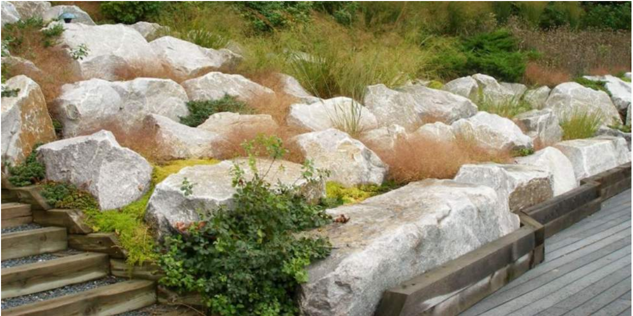
VEGETATED REVETMENT (AROUND BOX CULVERT)