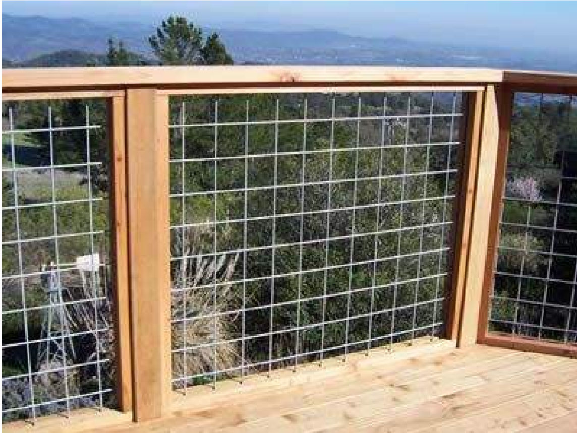
PEDESTRIAN GUARD RAIL