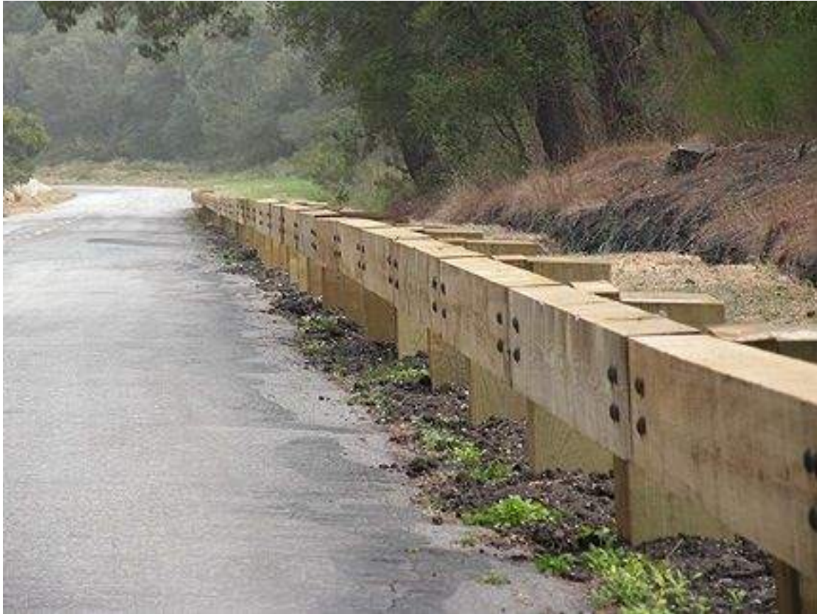
TIMBER VEHICULAR GUARD RAIL (TO REPLACE EXISTING METAL GUARD RAIL)