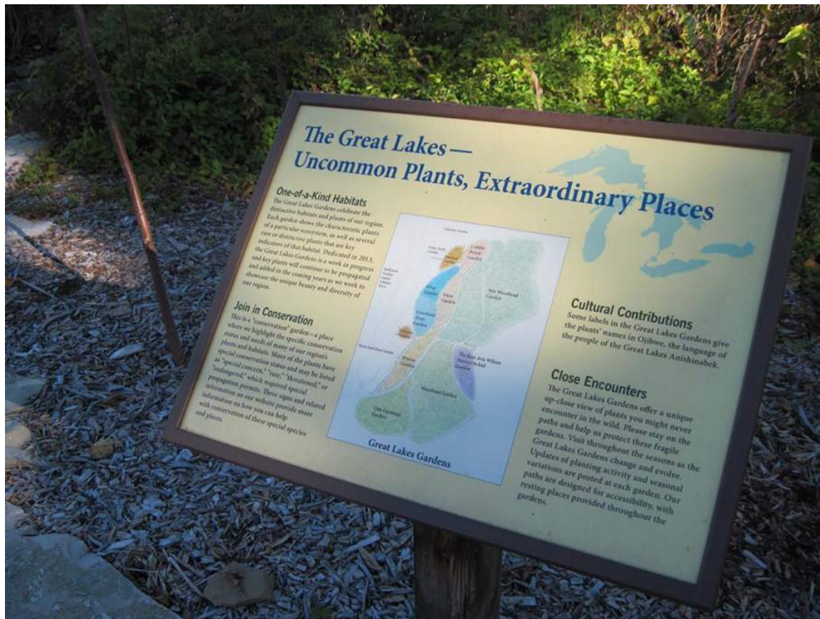
18" X 24" INTERPRETIVE SIGNS